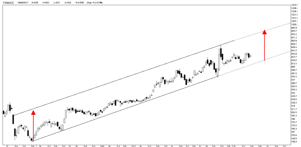
Kinerja sektor keuangan & perbankan

Sementara potensi Pertumbuhan BMRI memiliki potensi Pertumbuhan tertinggi di bandingkan beberapa saham di sektor perbankan dan keuangan, antara lain BBTN, BCA dan BBRI